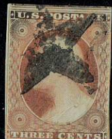
Worcester, MA 'star' cancel Simpson page