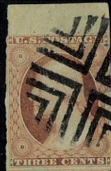
Shelbyville, KY 'pinwheel' cross- roads cancel on 1856 deep dull rose red, ex Amonette. Simpson Page 135