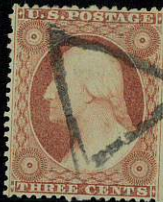
Canton, Miss Masons Temple