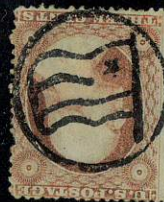
Flag in Circle; Naperville, IL 2- 3 known