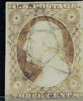
Danvers Centre, MA star and circle Simpson page 136/7