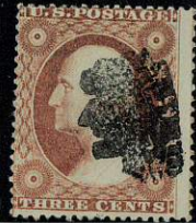
Indian Head Profile Profile House, N.H.