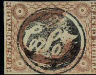
Canton, MA 'CST' obliterator (Caleb F. Taft Post Master). Simpson page 154/