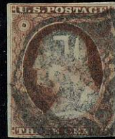
"US/MAIL" in Shield of Plymouth Hollow, CT (confirming cover - F. Mandell), 4-5