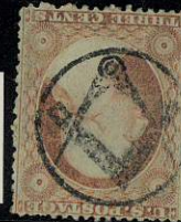
Cornish Maine Masons Compass Rare early use. EKU 1861