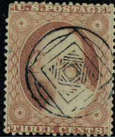
Complex Geometric Newmark Valley N.Y. 2 copies AG 2/24