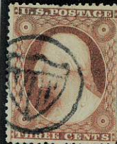
Conshohocken, PA shield in circle, 7 to 10 known